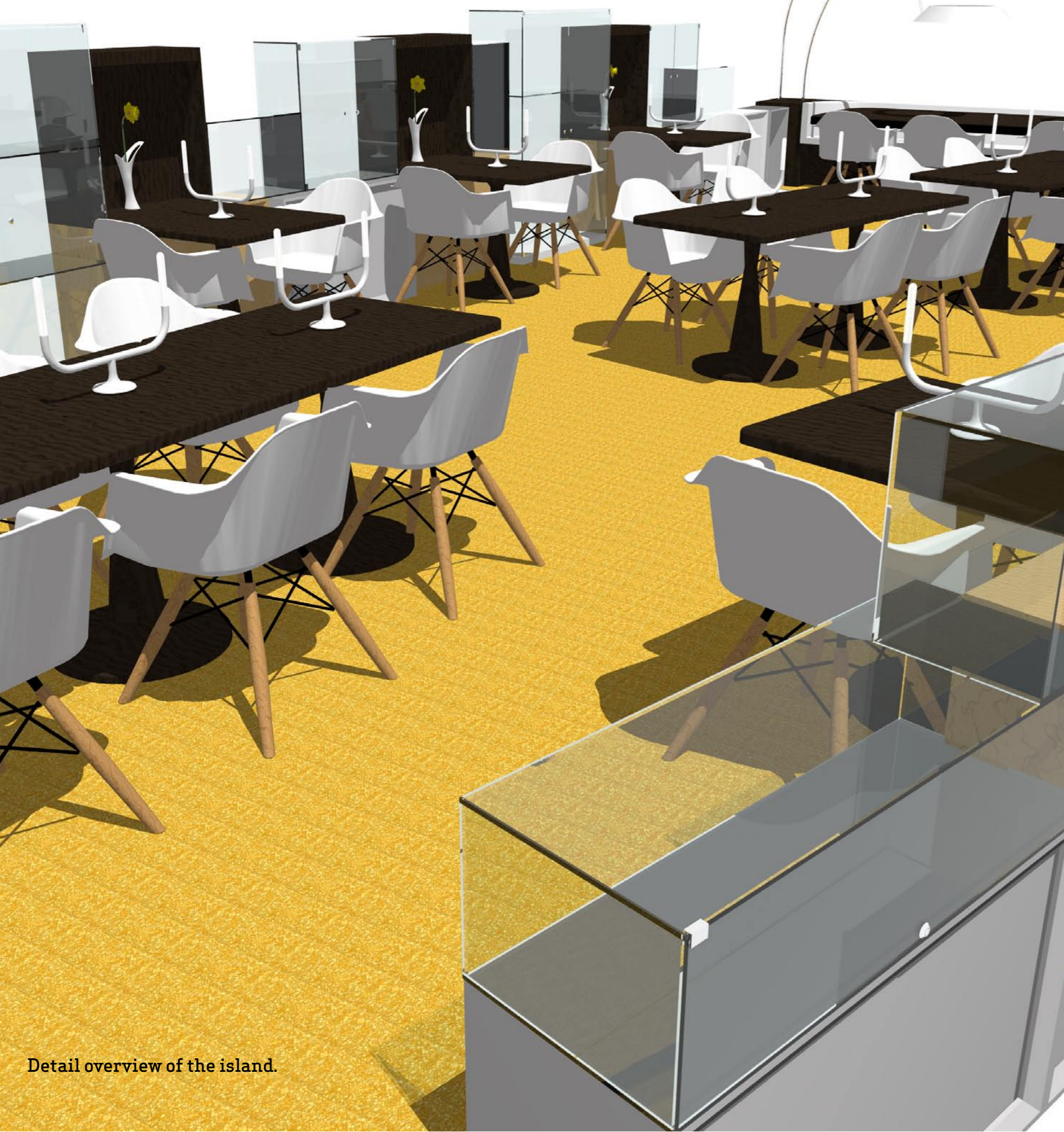
Detail overview of the island.